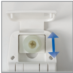
3/8" ADJUSTABLE HINGES