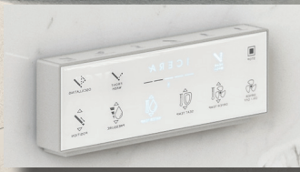
Remote image for reference only. Button layout may vary.