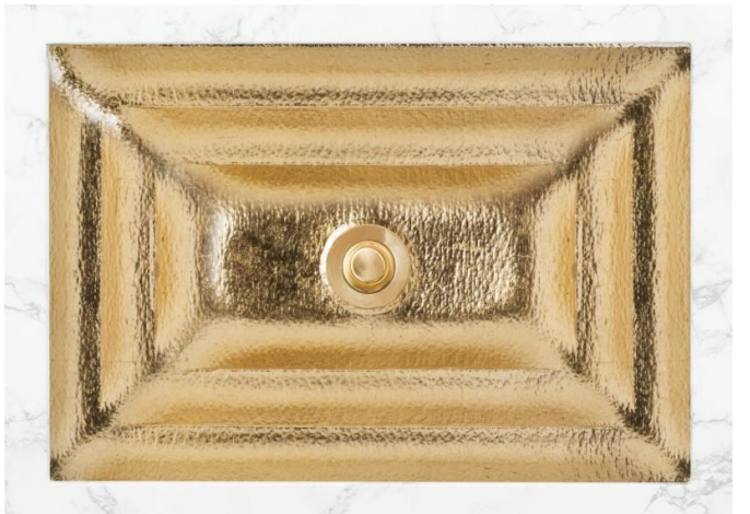
Shown in AG04C-BRS