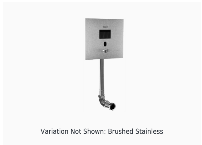
Variation Not Shown: Brushed Stainless