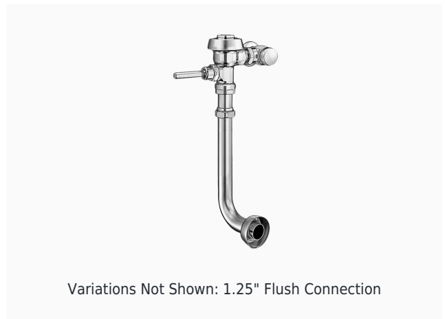
Variations Not Shown: 1.25" Flush Connection