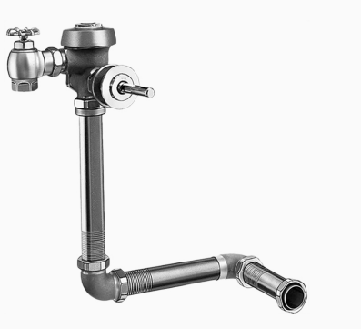
Variation Not Shown: 1" Straight Control Stop