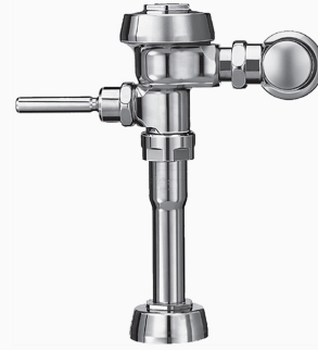
Variation Not Shown: Brushed Nickel