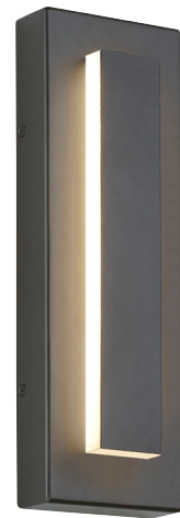
ASPEN 15 shown in charcoal