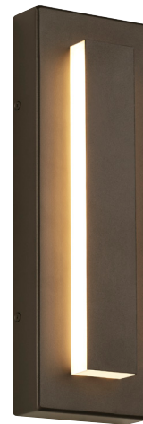
ASPEN 15 shown in bronze

* Visit techlighting.com for specific warranty limitations and details.