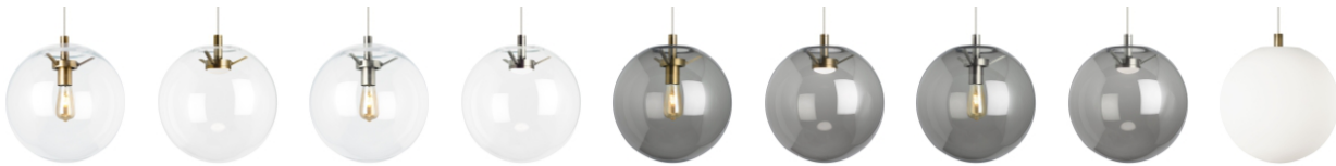
clear / aged brass clear / aged brass clear / satin nickel clear / satin nickel smoke / aged smoke / aged smoke / satin smoke / satin white / aged incandescent led incandescent led brass brass nickel nickel brass incandescent led incandescent led incandescent led