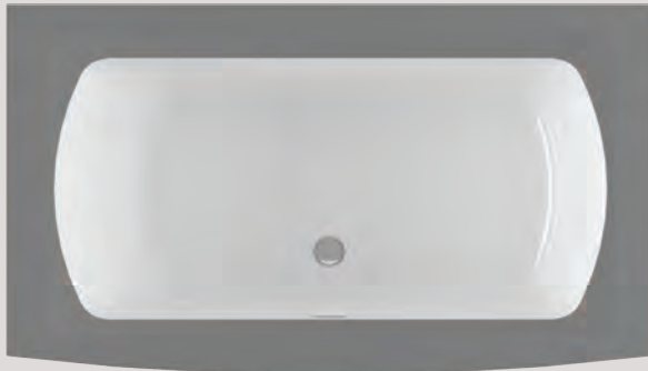
MONARCH 6638F CURVED DECK – FRONT