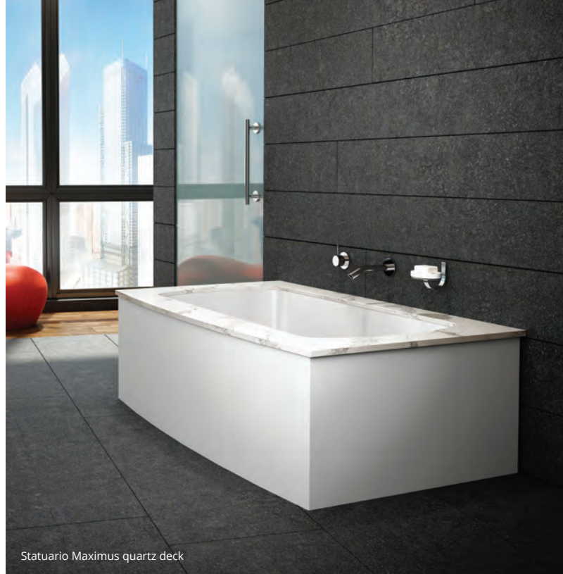
Statuario Maximus quartz deck