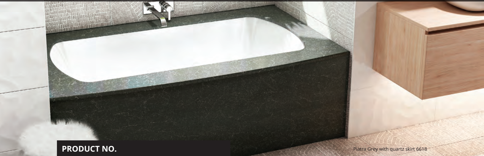
Piatra Grey with quartz skirt 6618

Monarch is a refined collection of therapeutic baths with distinctive Quartz deck surfaces, for a look that's noble and pure.